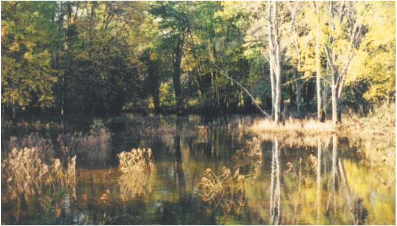
Wooded swampland along Cassadaga Creek.