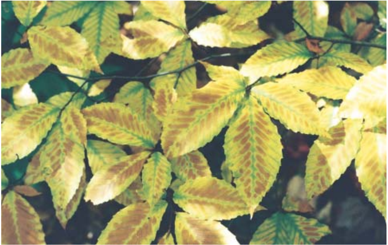
Autumn beech leaves.