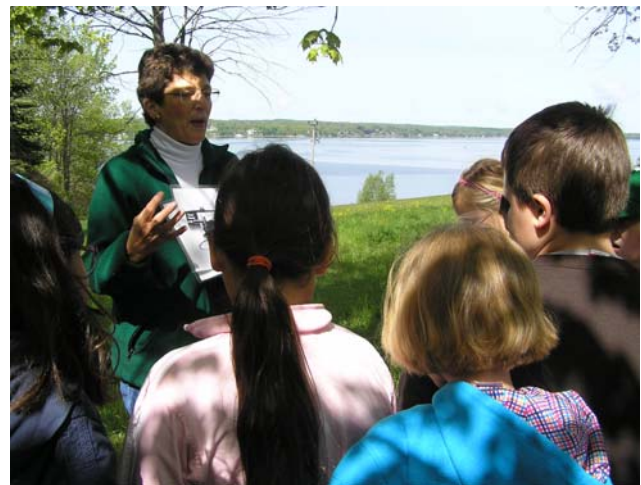
Above: CWC volunteers teach elementary school students the importance and means of being good stewards of the watershed and Lake at the Lake Chautauqua Lutheran Center in Bemus Point in the spring of 2007.