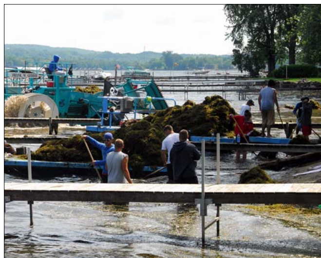
CLA summer employees help remove weeds from the lake.

The CLA also spent over 4,400 hours harvesting the weeds in the lake. Each and every day of harvesting, the CLA removed between 100 and 200 tons of weeds . The CLA's seven harvesters, supported by three transport barges, were in operation from dawn to dusk Monday through Friday, with the second shift beginning at 2:00 each afternoon. In addition, crews were at work on the lake each and every Saturday from 7:00 a.m. to noon. The harvesters and support barges operated out of Mayville, Shore Acres and CLA's home office in Lakewood. By staging the equipment at these three locations, travel time was avoided, and the operations were that much more efficient.